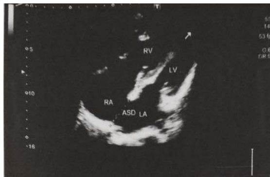
Figure 2 Transthoracic echocardiogram

After giving informed consent to the husband and family, the patient was prepared into the operating room. The infusion line is ensured to be smooth and a vital sign monitoring device is installed. The patient was anesthetized under spinal anesthesia with injection of bupivacaine heavy 0.5% 7.5 mg, fentanyl 25 mcg at level L2-L3 while loading 250 ml of crystalloid fluid and preparing norepinephrine drip. Baby girl weighing 2090 grams was born with APGAR score 8/9 and given oxytocin 20 units in RL 500 ml for 8 hours. The operation lasted 1 hour and 5 minutes. During surgery, the patient's hemodynamics could be stabilized by titrating norepinephrine drip to the highest value of 0.2 mcg/kg/minute and blood pressure fluctuations of 98-132/62-78 mmHg were achieved and the patient's shortness of breath gradually decreased. The patient was treated in the postoperative ICU for 2 days and was allowed to be outpatient after 5 days of treatment in the regular ward.