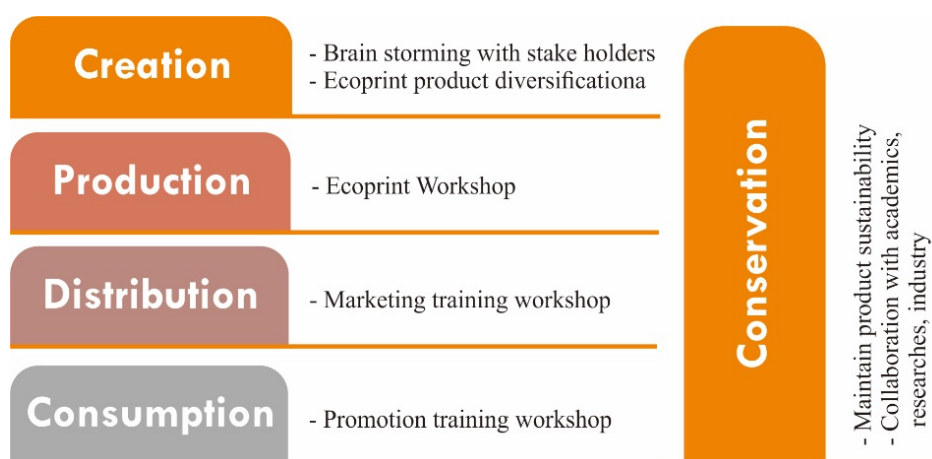
Fig 1. Value chain diagram of creative economy for the implementation of community service activities in Watusigar Village

The development assistance program for crafts is always associated with the economic creative value chain, namely the chain of creation, production, distribution, consumption, and conservation (Kementrian Pariwisata dan Ekonomi Kreatif RI, 2021). The implementation of this accompanying program was carried out by making the value chain the basis for the implementation process of the program. This was done so that the community understands the ecosystem of craft products such as ecoprint and encourages sustainability and self-reliance in the future. Considering these needs, the content of the implementation method for this community service program includes economic creative value components as shown in the diagram in Figure 1.