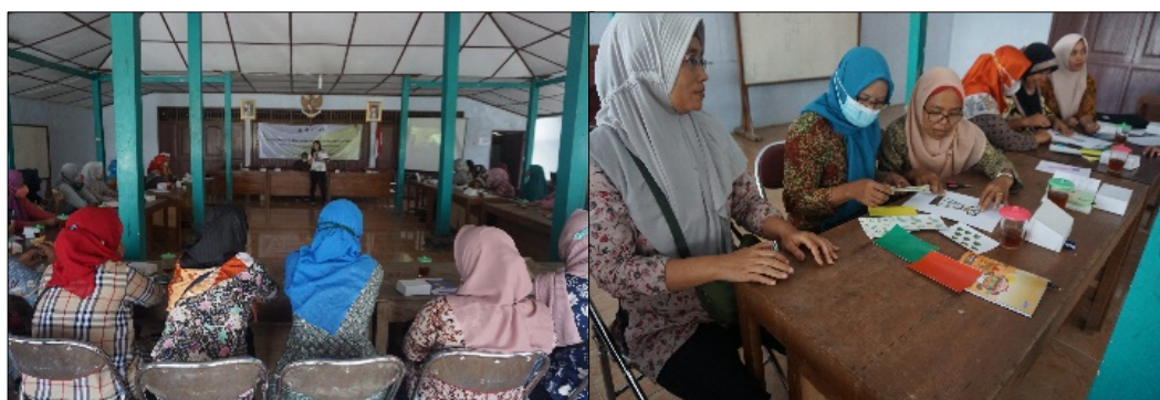
Fig 3. Day 1 training on the basics of ecoprint innovation products and digital marketing