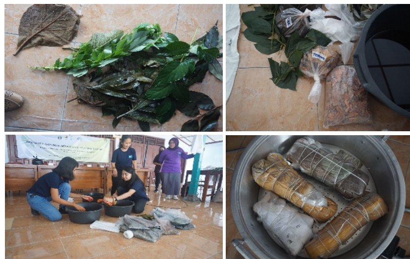
Fig 8. Plants as the natural dye materials for ecoprint products

natural dyes. The local community already has knowledge about these local plants, but they need to be educated on how to utilize them as natural dyes.