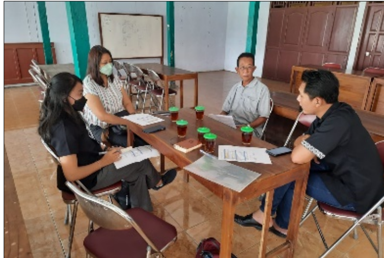
Fig 2. Discussion on the preparation for the implementation of local innovation training on ecoprint products in the Pendopo of the Watusigar Village Office