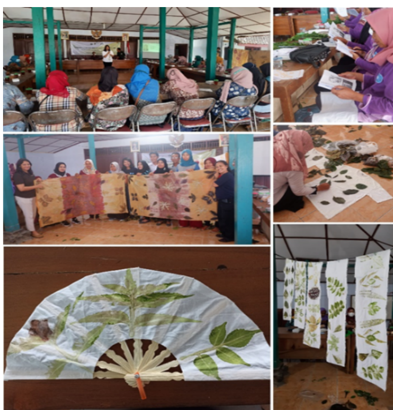
Fig. 5. The activities of community service (PkM) and the diversified products of ecoprint innovation produced during the implementation of community service