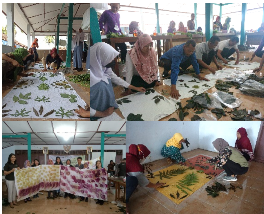
Fig. 4. Day 2 training on practice of making ecoprint products and initiation of business group formation