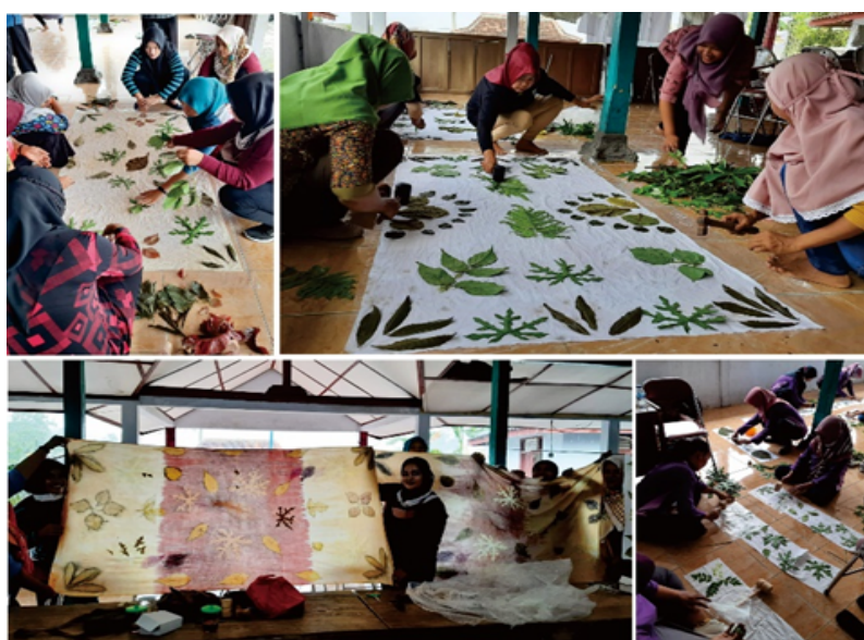
Fig. 6. Activities during the ecoprint innovation product making workshop

The creative process previously learned in the form of product diversification and principles of leaf composition arrangement were applied in this ecoprint workshop process. In this production process, participants were also introduced to the types of materials and equipment needed, how long the process takes, the availability of raw materials around them, and tips for overcoming common obstacles in the production of ecoprint innovation products. While waiting for the results of the steaming ecoprint products they have made, participants practiced making ecoprint products using the pounding technique. The ecoprint production process, especially the pounding technique, requires patience and perseverance from the participants as it was their first time making it. However, this effort paid off when they saw the results of the ecoprint products they made. The participants, consisting of community leaders, community members, and Karang Taruna Kalurahan Watusigar, were very enthusiastic during the ecoprint workshop. Participants did not expect that leaves and even roadside grass, which seemed to have no use and were sometimes considered pests, could be transformed into an attractive product that could become a branding for Kalurahan Watusigar.