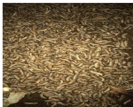
Fig. 5. Results of the maggot cultivation for catfish feed by Karang Taruna Bulu