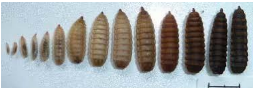
Fig. 3. Development of BSF (Makhrojan, 2018)

Figure 2 shows the development time of BSF in each stage of its metamorphosis seen in days. Adult BSF flies lay their eggs near food sources. Maggot has 5 instars in its development and can grow up to 20 mm (Figure 3), pupae migrate to a more humid place to then grow into adult flies.