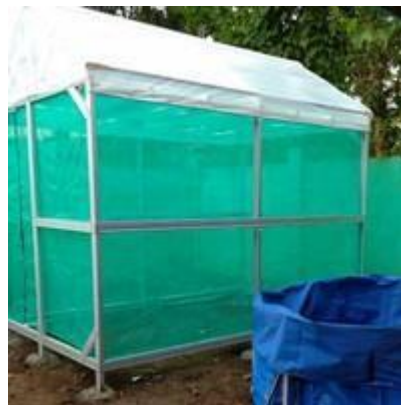
Fig. 4. BSF Cage made of HDPE plastic mesh

Karang Taruna Padukuhan Bulu managed to build 3 plots of maggot or biopond cages (Figure 4), as well as 1 plot of maggot breeding lair, made of wood and HDPE plastic mesh with a size of 1.5 m x 2 m with a height of 2 meters and a roof made of asbestos and fiberglass, while the maggot enlargement cage (biopond) is made with a size of 1m x 2 m with 20 cm deep. The practice of maggot cultivation begins with 7-day-old baby maggots that are put in a biopond cage and kept for 12-21 days. As a medium or maggot feed, household waste and chicken egg waste from the chicken factory in Kapenewon Semanu are used, which are taken free of charge. The results of cultivating maggots with 5 grams of maggot eggs, after being hatched and raised into larvae, produced 20 kg of maggot larvae. with a maintenance period of 12 days in a biopond (Figure 5). Maggot is directly given to catfish ponds as animal feed, with a ratio of 30% maggot and 70% commercial feed.